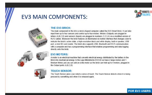
Course Students Zone